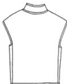
View A, B