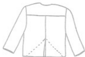
View A or B

View C has a triangular front section for a flattering diagonal line. The clever, topstitched sleeve can be added to any jacket or shirt on a future project.